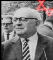
Theodor W. Adorno aka Theodor Ludwig Wiesengrund

Who were the members of the Frankfurt School? Well, let's take a look: